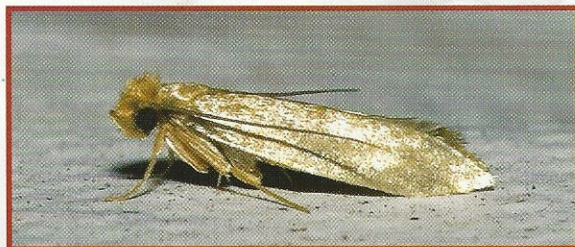
Clothing Moth ( Tineola bisselliella )

The fumes from mothballs kill clothes moths, their eggs and larvae that eat natural fibers in indoor storage areas, such as closets, attics and basements.